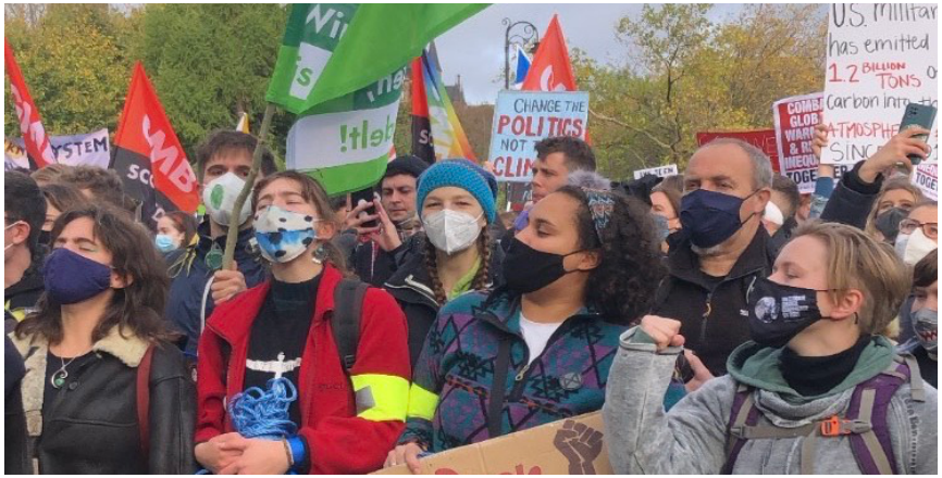
Pictured: Crowds protest at the COP26 in Glasgow, Scotland.

"What do we want?" what do we want? a lone voice shouted, to which the crowds responded, "Climate Justice!" "When do we want it?" and again they cried, "Now!" 100,000 people flooded the streets on Saturday to streets on Saturday, to show up for Climate Justice. We screamed Justice. We screamed this call and response on the streets in the cold and rain of Glasgow, Scotland, all week, until our voices were raw, while world leadedrs sat behind closed doors in warm rooms, deciding the fate of our planet at