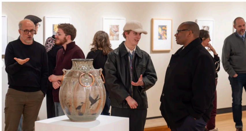
Ortlip Gallery Show