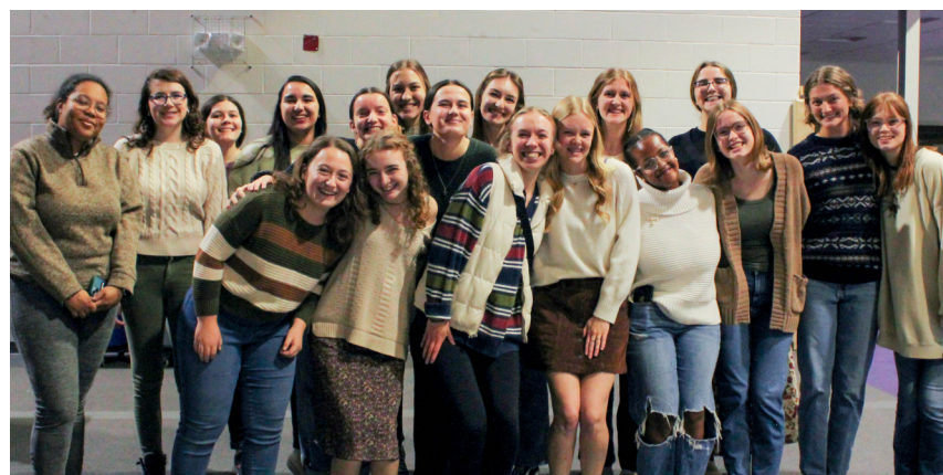
Friendsgiving RA Group Photo