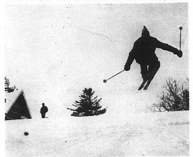
Skier Gary Newton practices jumps for Winter Weekend.