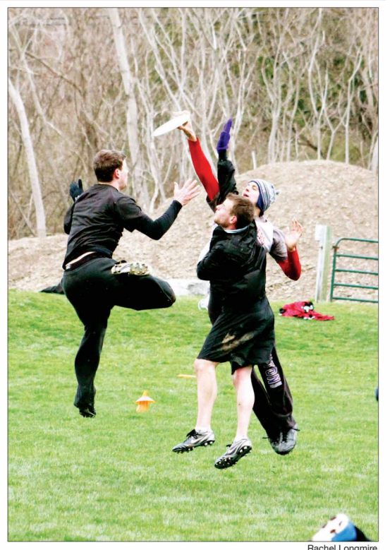
Frisbee players on the Field of Dreams