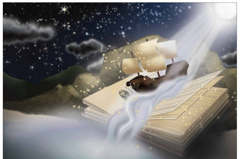
Portal to Adventure, Digital