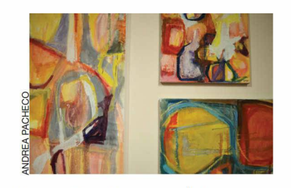
SENIOR ART RECEPTION | ARTS AND SPORTS, P. 4