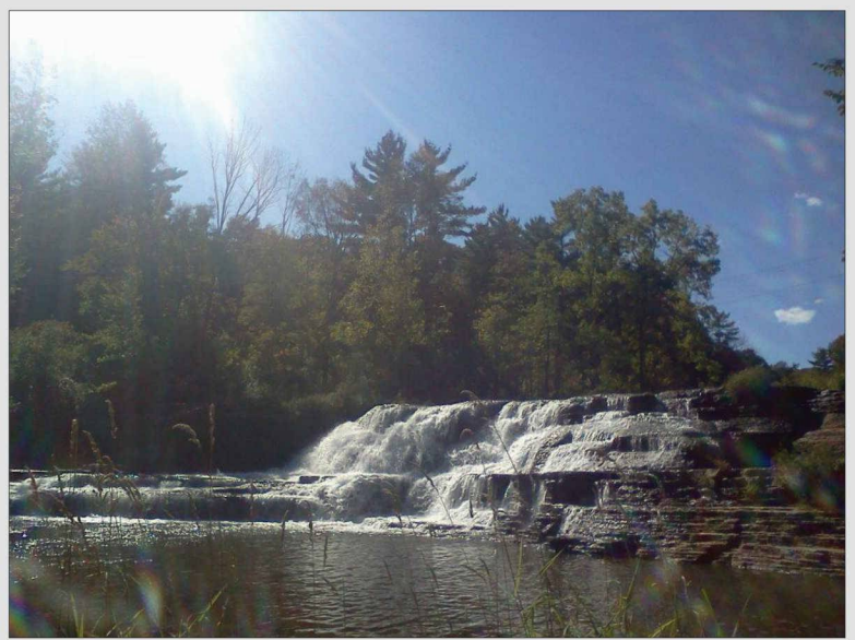
Spring at Wiscoy Falls

Since it is only early spring, I would not recommend swimming at Wiscoy just yet. But you may still enjoy the picturesque scenery and take the opportunity breathe the clear air of a white-water Spring.