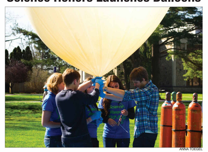
Science Honors group members prepare to launch their balloon.