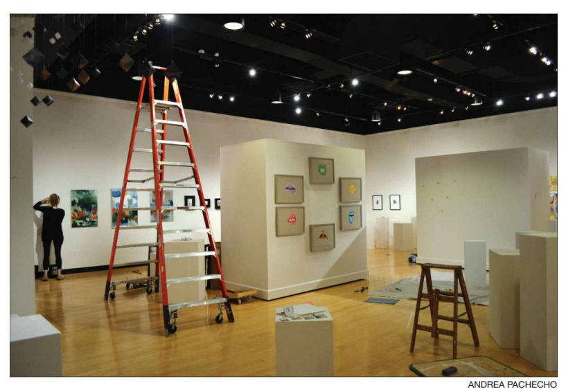
Senior art show in the making