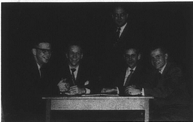
The Houghton College Debate Team, which will represent Houghton at the Grand National Debate