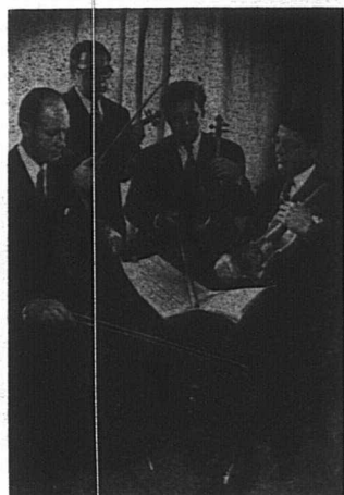
Berkshire String Quartet

The Quartet is in residence at Indiana university from September to June. During the summer the quartet gives a ten-week series of concerts at Music Mountain, Falls Village,