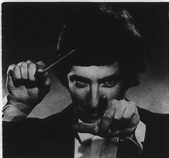
Michael Tilson Thomas