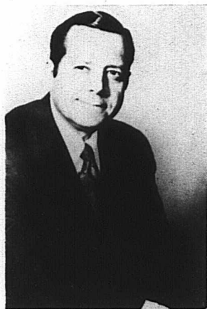
Dr. William Bright

In 1961, the secular National University of Korea conferred upon Dr. Bright the honorary degree of Doctor of Laws, "for the meritorious contributions to the development of human culture and the advancement of world peace through the establishment of Campus Crusade for Christ." In 1966, John Brown University honored him with the degree of Doctor of Divinity. In addition to directing the international ministry of Campus Crusade for Christ, and filling a heavy schedule of speaking engagements, Dr. Bright is the author of numerous articles, pamphlets, and two books: Revolution Now! published in 1969; and Come Help Change the World , published in 1970.