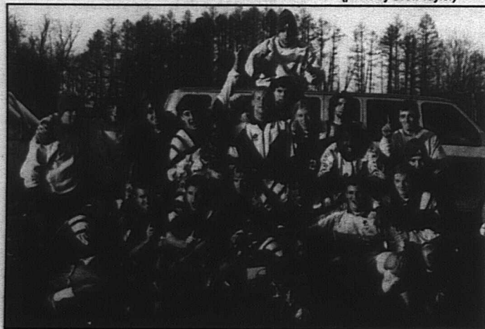
The soccer team excitedly shows off the regionals trophy after their win over Green Mountain Nov. 16.