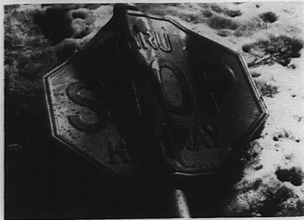
Some Don't Stop For Anything