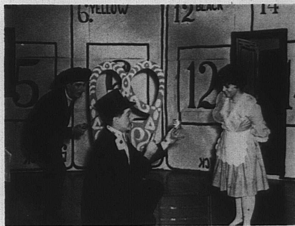
Lantern Players: See Review, Page 3