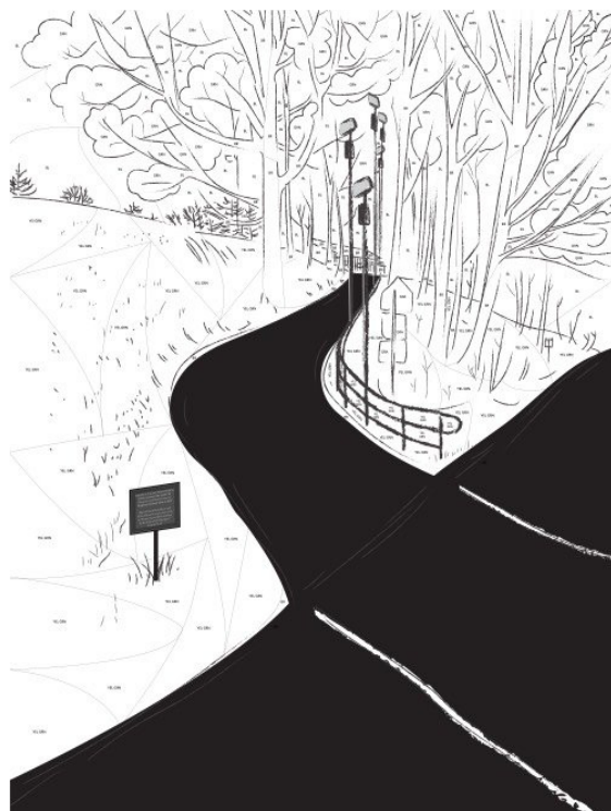
Envisioned design for the senior class gift

With the 2023 Senior Class Gift already in construction, students can expect to see the finished product in time for this academic year's commencement ceremony. ★