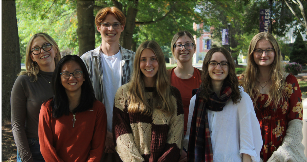
Members of the Houghton STAR staff Wednesday near the Quad.