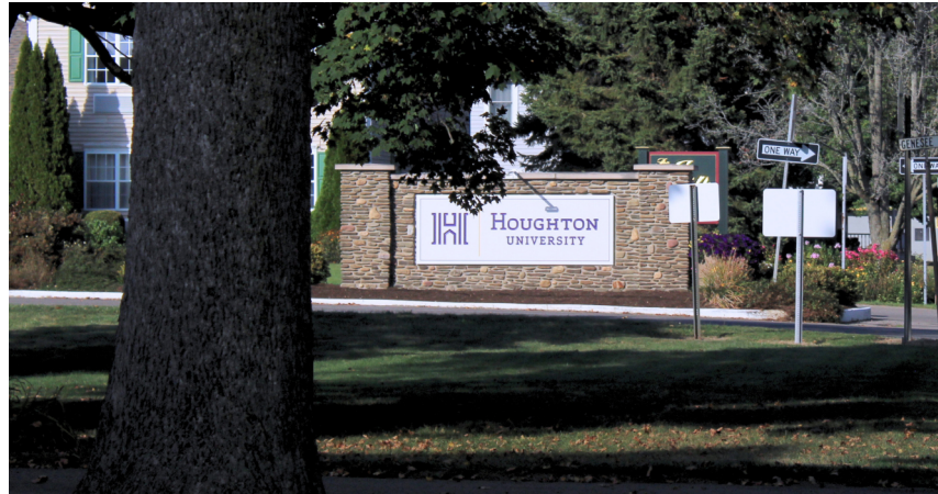
The Houghton sign.

The Houghton Pisser (HUP) is only one of a growing social media trend among school pisser social media accounts of unidentified individuals committing excretory acts around their chosen college campus. The trend began in the western region of New York with SUNY schools. The Brockport Pisser posted its first TikTok on Aug. 26 and the Oswego Pisser posted on Aug. 30. It has since spread nation-