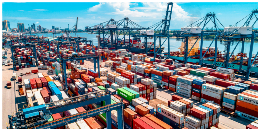
Dar Es Salaam Port Harbour.