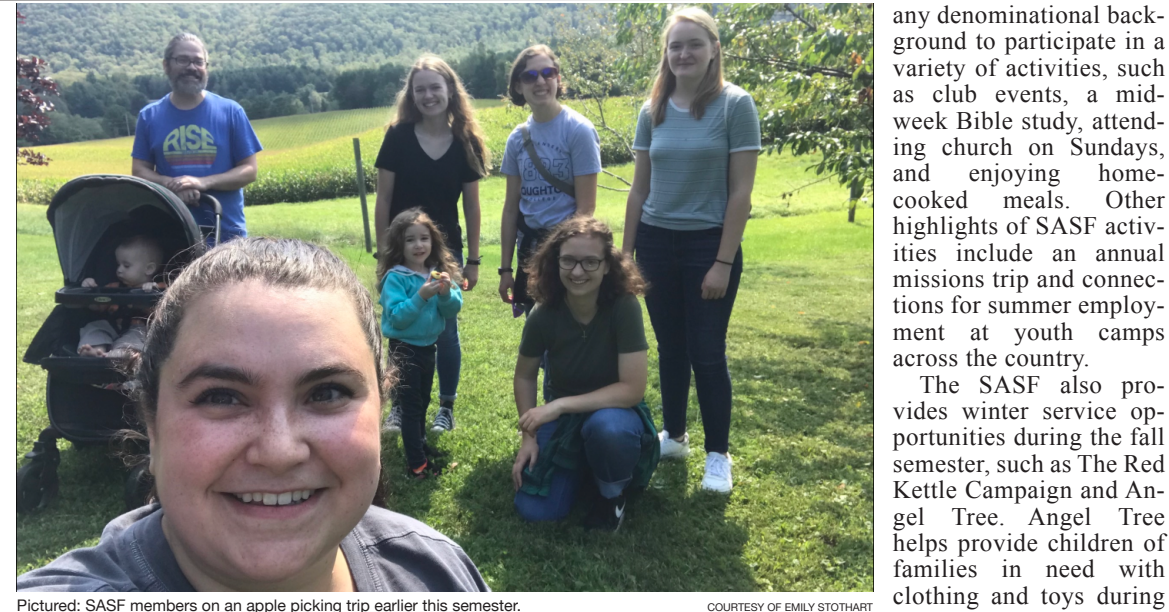
Pictured: SASF members on an apple picking trip earlier this semester.

The Salvation Army is a church, and provides need. Their