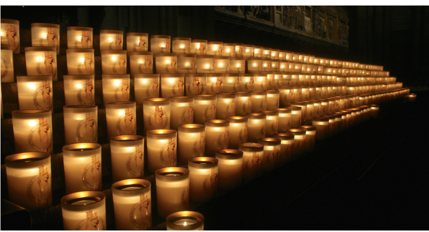
Pictured: Candles at a prayer vigil in Notre Dame at the COP-21 climate conference in Paris, 2015.