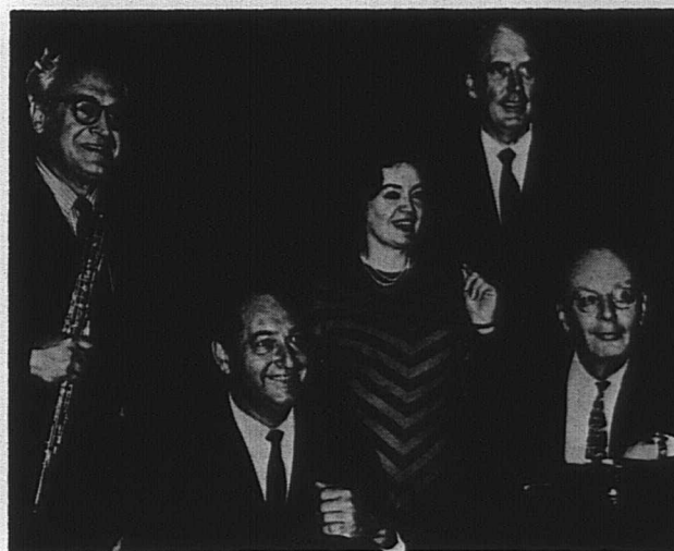
The Bach Aria Group