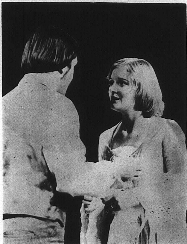
Sentimental heroine confronts the Devil's disciple.