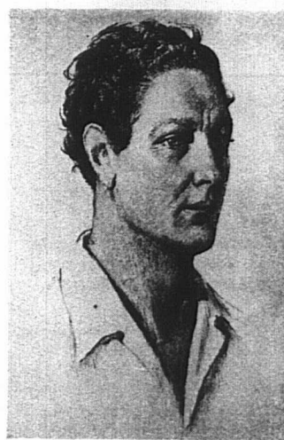
COUNT BYRON DE PROROK