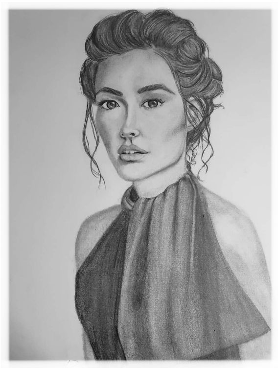
Art: Lisbeth Crompton

Bathed in warm yellows Tilt my head up, close my eyes Greeted by a sea of mellow red Sink my toes beneath the sand Past the coarse rocky mosaic Into the cool blue underneath For a moment, a kernel of truth Stretched between the sky and the earth Somehow I'll find my way back to you