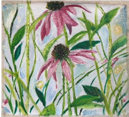
Art: Caroline Oakes

Brisk air rushes toward the face Holy Spirit, you are welcome here Slight chill is caressed by beaming sunlight Birds sing cheerfully I am with you always Dew sprinkles the green growing grass Let the riches of My kingdom fall on you Flowers poke and prod the soft soil My creation endures forever Trees bud and sway in the breeze I have died for you so you could live again White fluff rolls high above, in the bright blue sky Heaven is closer than you believe Rain is soon to come and I have sent a rainbow, and it will be a sign of My covenant New hope rises from death Spring is God’s promise to us To renew the Earth To rejuvenate our relationship He is a creative and most beautiful God An awesome God, He reigns Sovereign over everything.