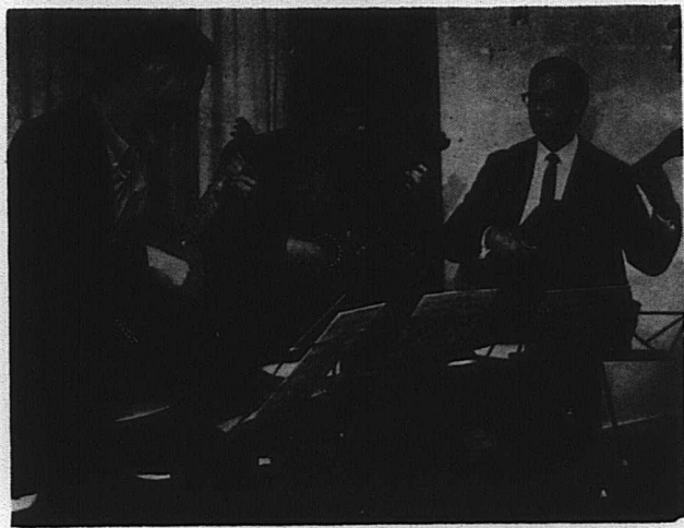
The Dik Visser Guitar Trio will perform tonight in Wesley Chapel.