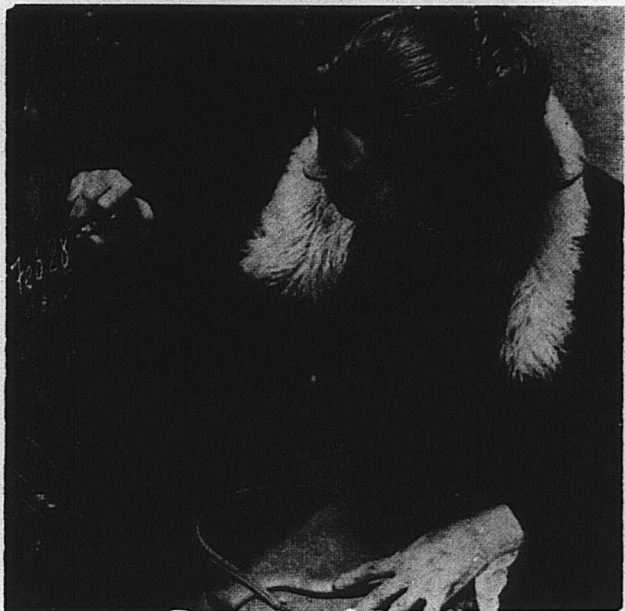
Corrie ten Boom in solitary confinement at Scheveningen.