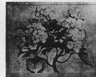
C. K. Nelson's "Hydrangu"

the Arizona pieces are charcoal drawings, and by their detail show Phoenix as hot, dry, and still. The paintings of Maine are colorful (watercolor and crayon or chalk) and full of movement. The lines are less clear and therefore less stiffening. Many of Nelson's paintings contain geometric shapes, but she is not limited to hard lines or solid forms.