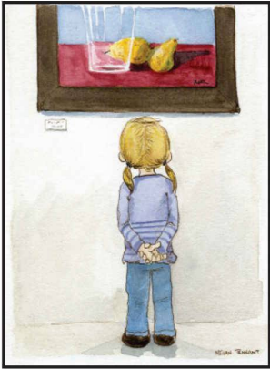
The Art Gallery, watercolor