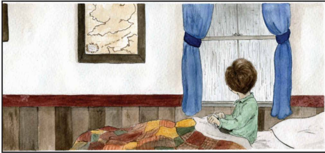
Earl's Gray Day, watercolor

What is wonderful about studying illustration is that I get the chance to visually create and explore stories, interesting characters, and new places, all just with pencil and paint. I love literature and the storytelling that is captured in books, as well as the visual feast of good art, and illustration enables me to blend these two passions. I hope to illustrate children's books in the future. I work with watercolor and ink (and sometimes colored pencil). Megan is a senior double major in English literature and art.