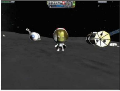
Screenshot from the game