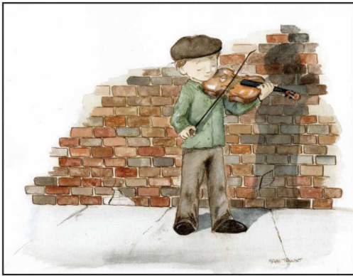
Street Violinist, watercolor