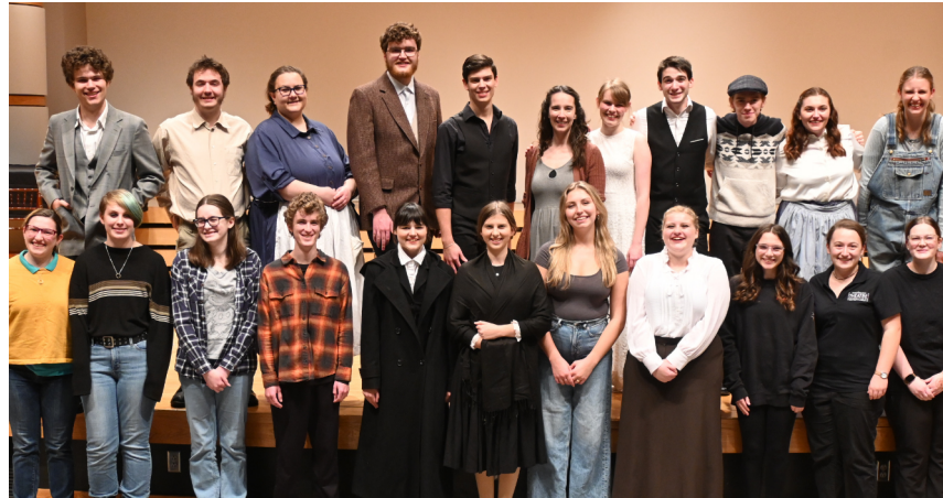
Our Town Cast and Crew

The two-and-a-half-hour production follows