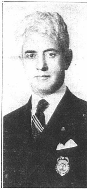
Dr. Edwin Franko Goldman