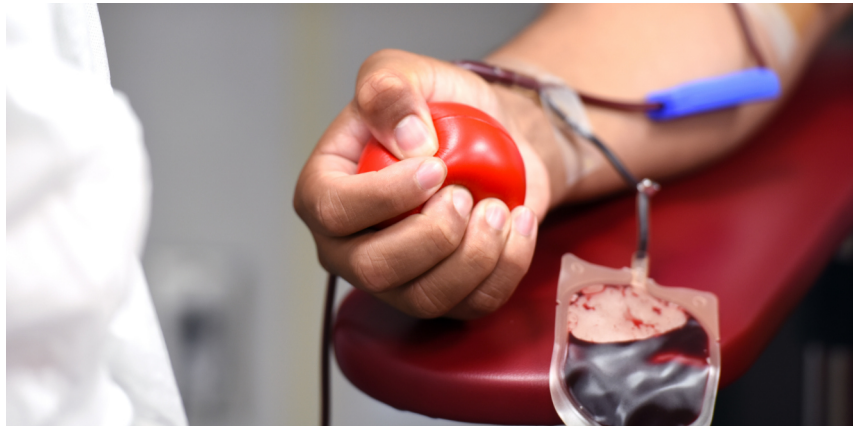
A donor giving blood at a blood drive.

The fire department will host one more blood drive this month on April 21. Orr urges students to show up.