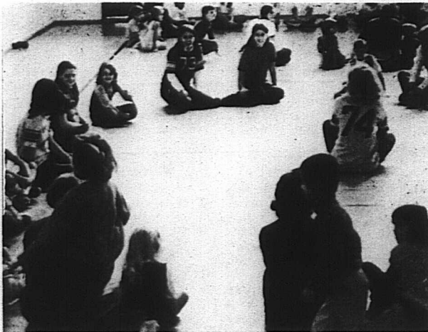
The ministry of ACO, most visible in its children's parties, extends on a more personal level to every part of Allegany County.