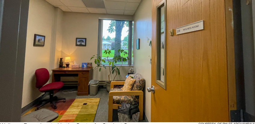
counseling side of the Wellness Room located in the Center for Student Success

Located on CSS, the Wellness Room is equipped with various features and resources added to suit as many wellness needs as possible. "[This addition