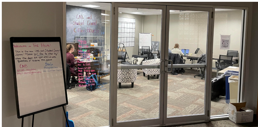
The office space for Student Council and CAB, located in the lower level of the Campus Center.