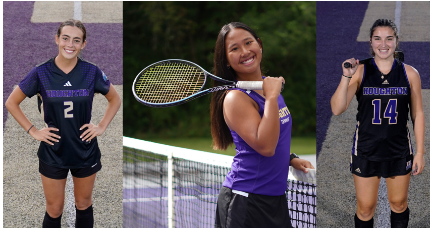
Women's Soccer, Women's Tennis, Women's Field Hockey

Their first win was last Saturday against Utica where they "snapped an 18 game loss streak." Head