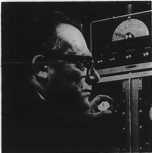
Mr. Vladimir Ussachevsky is the director of electronic music studies at Columbia and Princeton Universities, and is noted for his compositions and experiments with the synthesizer.