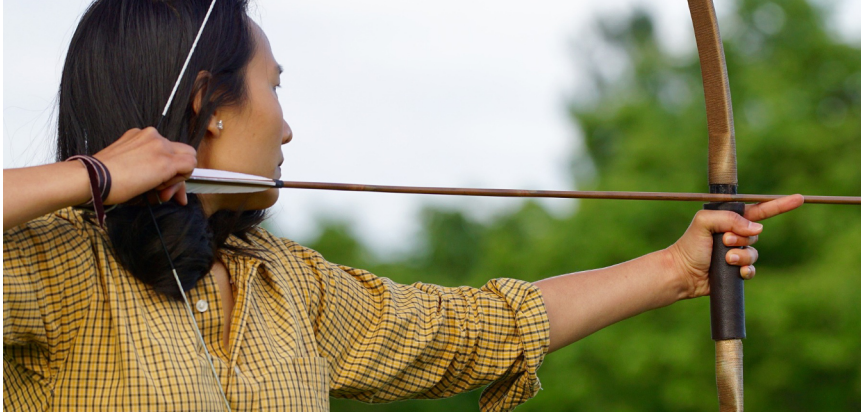
Houghton will welcome a new archery club next fall.

Archery Club aims to cater to all levels of archers, from beginners to pros. So far, around 25 students have expressed interest in joining the club, including 11 students who already own their own bows and want to practice. Most of these students are hunters, although a few have competed.