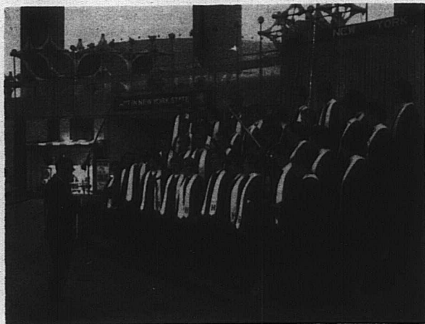
Choir Sings at New York Pavilion In the Shadow of the Unisphere