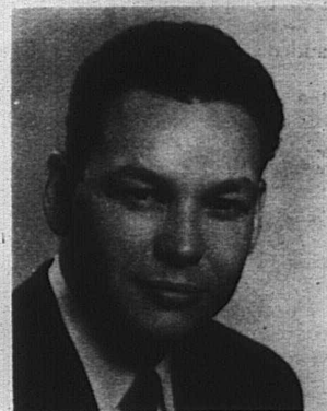
Herbert Philbrick On The Spy-Filled Life

He also wrote a syndicated column (Continued on Page Four)