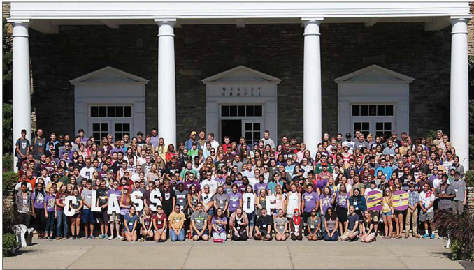
The incoming class of 2020 has extended Houghton's upward trend in first-year enrollment, and also features greater gender parity than in years past.