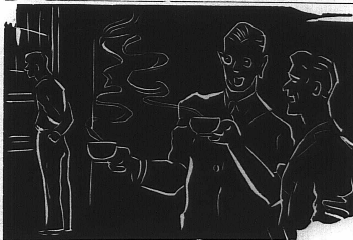
"He's the only democrat in the class, so he gets no coffee."

It is plain that anyone may serve who has a love for the Lord. Milton wrote, "He also serves who only stands and waits." One may say, "He also serves who only kneels and prays." Won't you help?