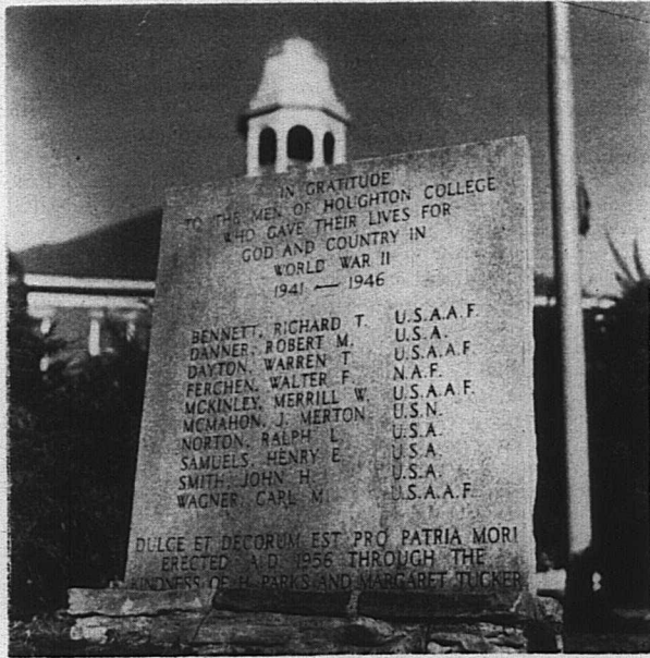
Memorial Day: Lest We Forget Does 20 years Make a Difference?