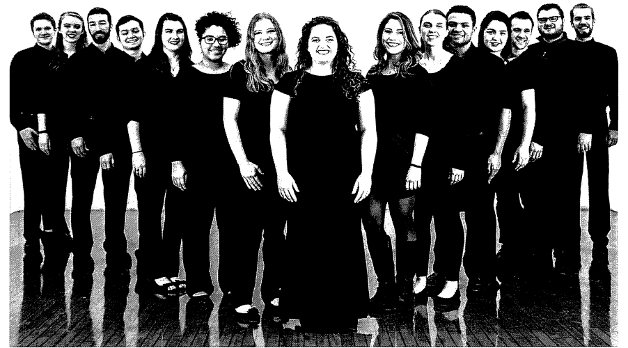
THE POP A CAPPELLA ENSEMBLE OF THE GREATBATCH SCHOOL OF MUSIC AT HOUGHTON COLLEGE