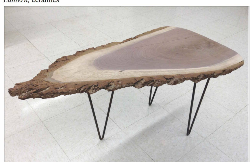
Table, wood & metal