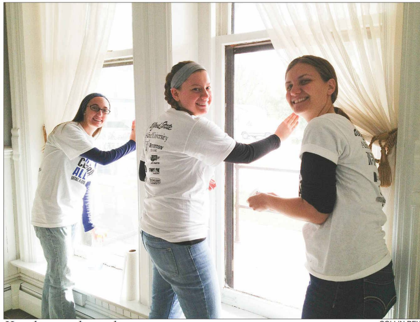
Houghton student volunteers