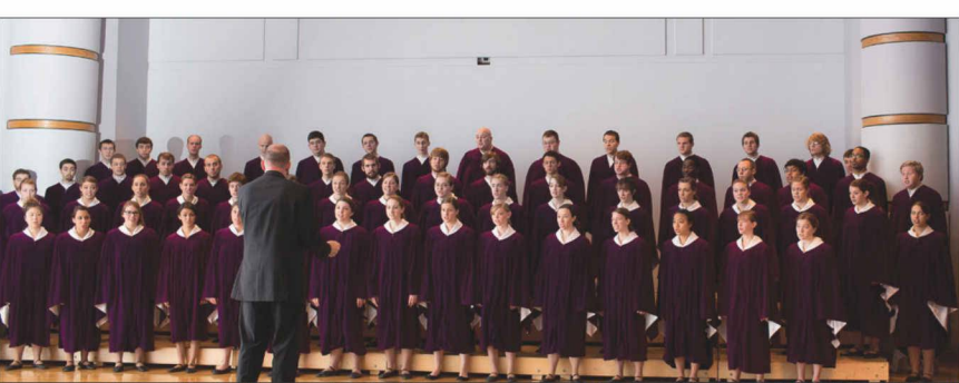
Past College Choir lineup, including new ensemble members