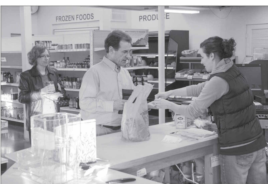
Customers at the co-op make their purchases