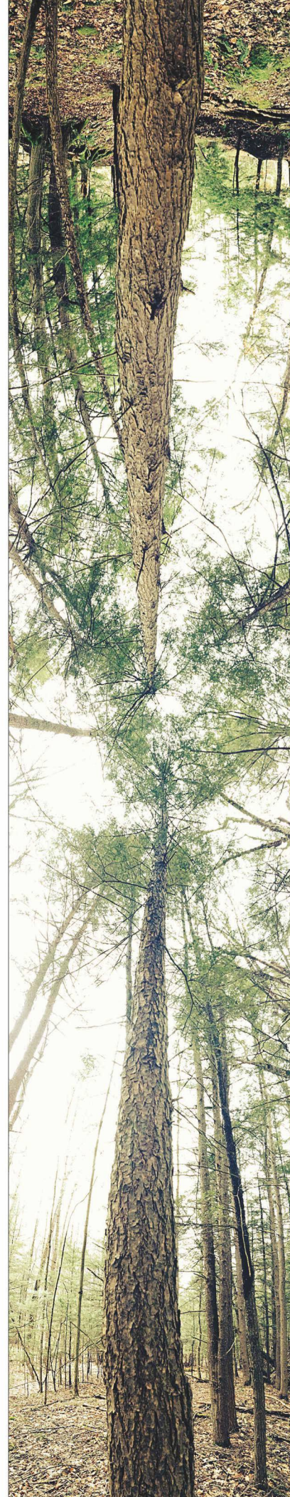
Looking Up, photography